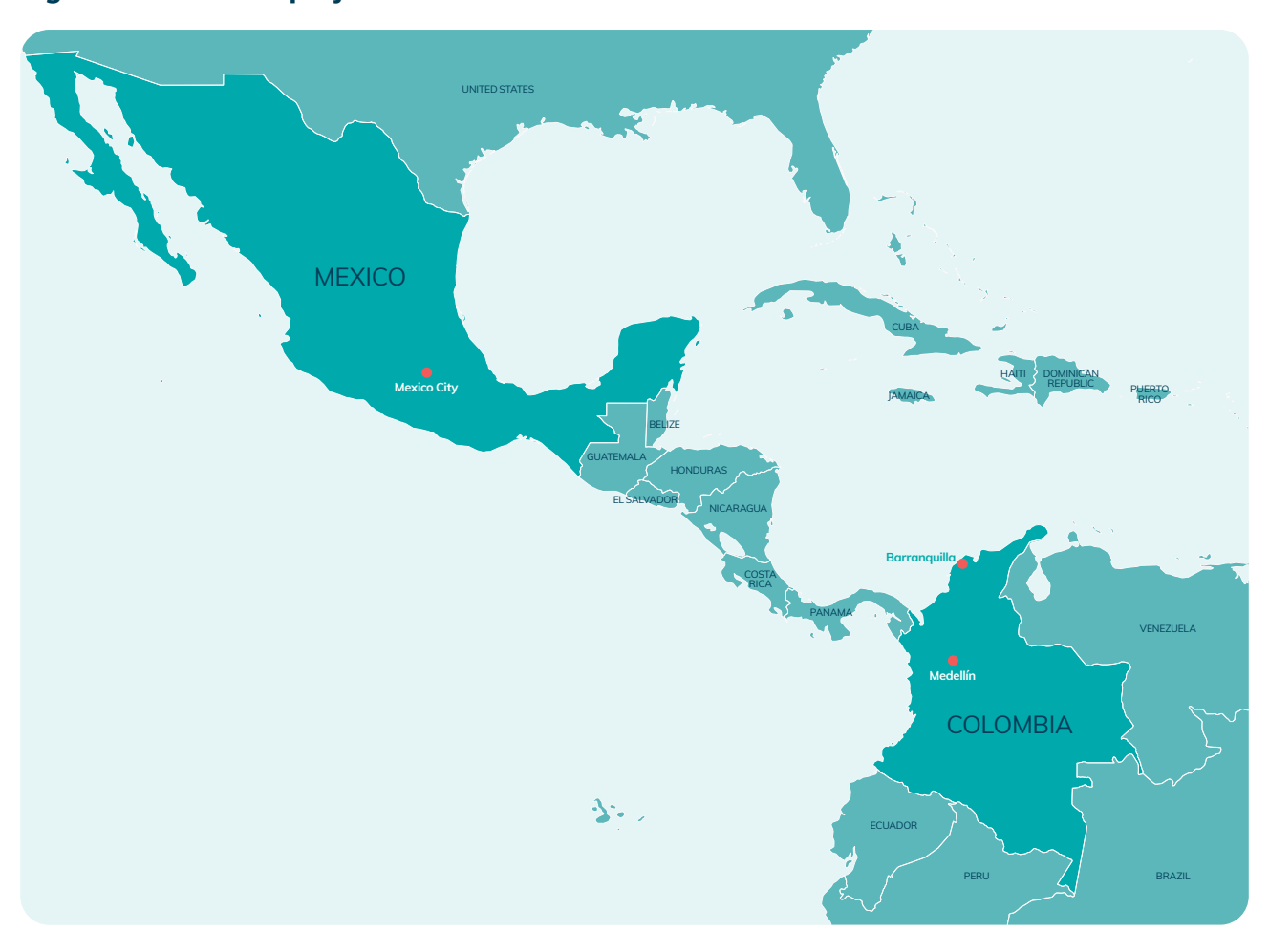
Figure 2. 4Mi Cities project locations

4Mi Cities aims to build evidence to better inform local responses to mixed migration in cities and create a strong case for national and international legal, fiscal and policy frameworks that enable cities to adequately provide necessary services to refugee and migrant populations. The data collected will be used by city governments involved in the project, as well as humanitarian and development actors, to improve their current migration policies and responses at city level.