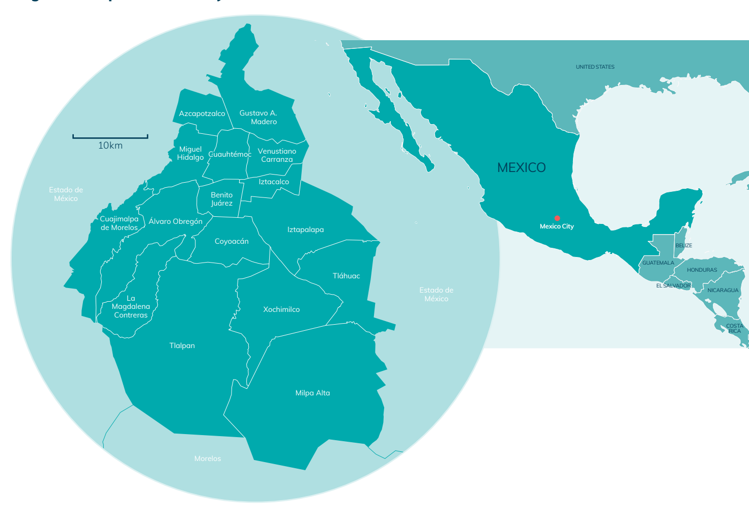
Figure 1. Map of Mexico City